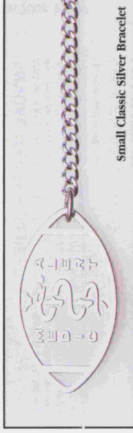
Small Classic Silver Bracelet