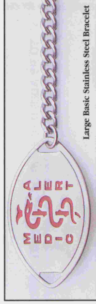
Large Basic Stainless Steel Bracelet