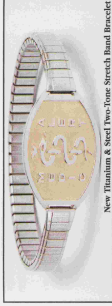
New Titanium & Steel Two-Tone Stretch Band Bracelet

A wide selection of 14k Gold and Sterling Silver emblems, pendants and chains are also available. Please call 1-800-432-5378 for more information or to request a Designer emblem collection brochure.