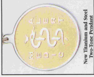
New Titanium and Steel Two-Tone Pendant